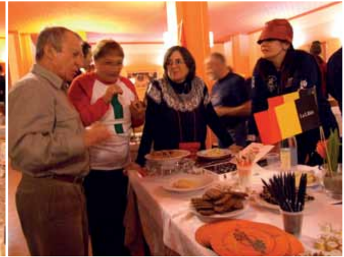
▲ Italian prosecco, Canadian whisky and Belgian pralins in Nations' Night