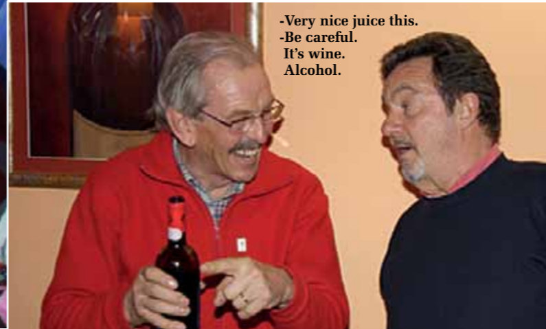
-Very nice juice this. -Be careful. It's wine. Alcohol.

passing through road between Tuscany and Modena was built in 1776. For example Giacomo Puccini had a villa in the village of Boscolungo in the early 1900s.