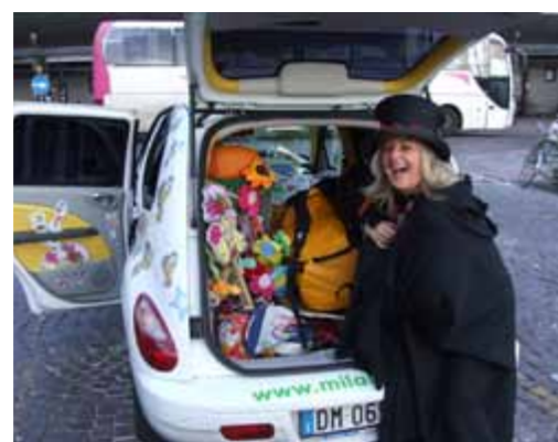
Crazy Lady or the Florence guardian angel of cancer children

Secular power had its part in the competition". The silhouette of the town shows, that the tower of the "Palace of the People" on the edge of