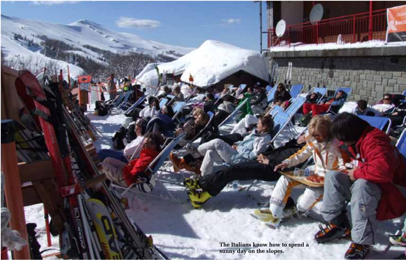
The Italians know how to spend a sunny day on the slopes.