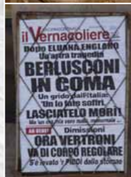
Notizie false ►