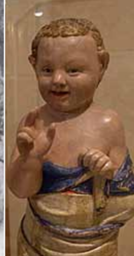
► Baby Jesus gives us his blessing in the art gallery of Banca Monte dei Paschi di Siena