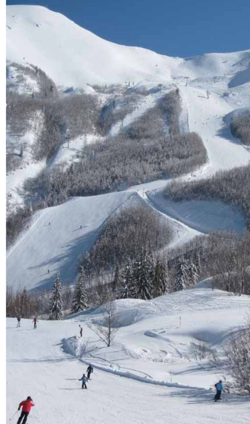
▲ The Italians know how to make an event impressive with flying colours