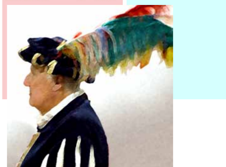
Portrait of the Mayor of Abetone