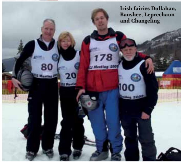
Irish fairies Dullahan, Banshee, Leprechaun and Changeling