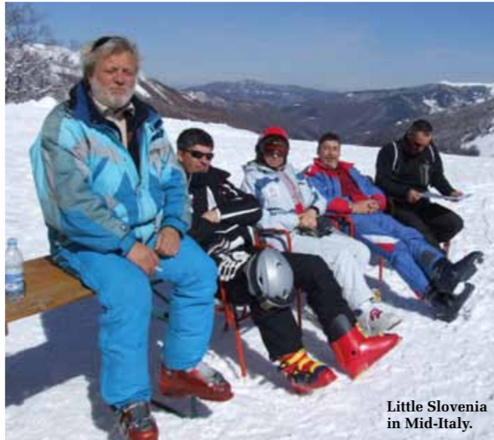
Little Slovenia in Mid-Italy.

I considered the most intelligent way to start my skiing was to take a free ski bus to Monte Gomiton gondola station. A mistake! To reach the lift station one has to climb from the parking lot to a height of about three-storey