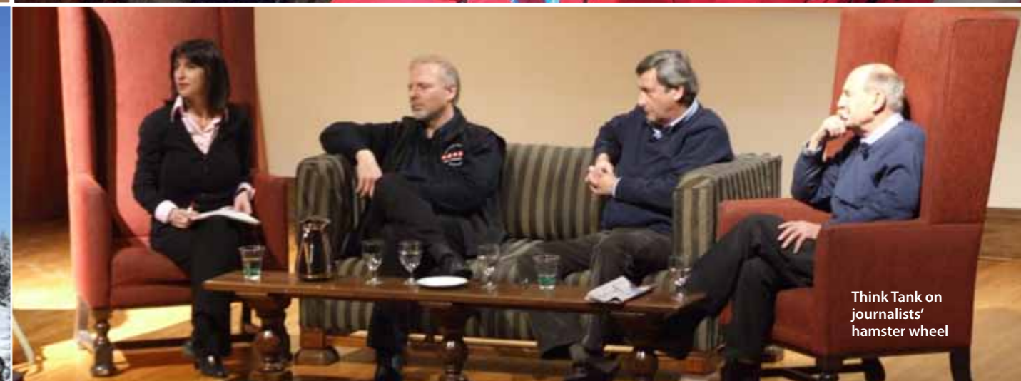
Think Tank on journalists' hamster wheel