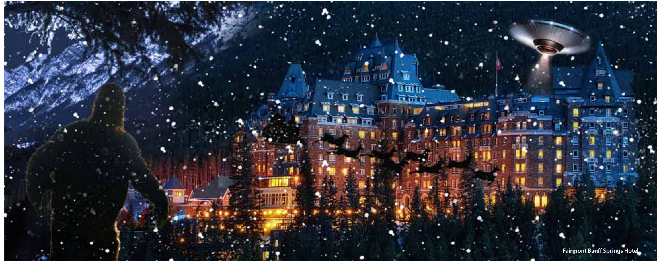
Fairmont Banff Springs Hotel

The non-ski day offered us entertainment to all tastes. Flavour of the Region, historic and cultural attractions, walk to the breathtaking upper icefalls of Johnston Canyon, a photo expedition to the iconic landscapes of Banff National Park, snow-shoeing and cross country skiing we offered. Soft pressure by friends forced me, a sworn ascetic to throw myself into the world of pleasures of taste: good, bad, bitter, sweet, queer and fresh. Wine and beer we were familiar