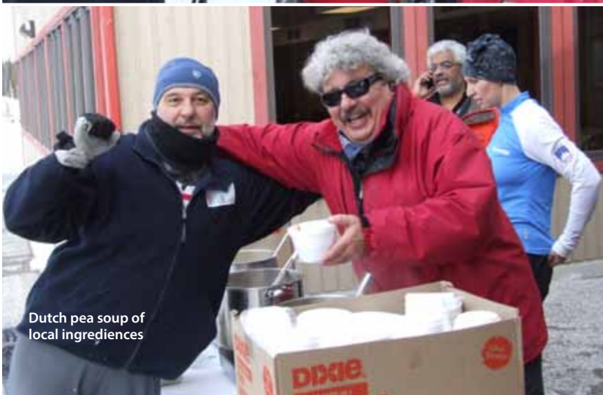
Dutch pea soup of local ingredients