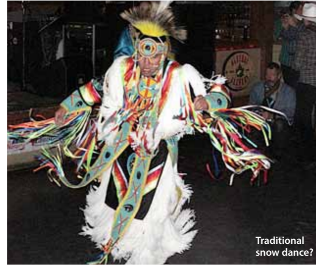
Traditional snow dance?

There was some uncertainty about the course of the evening. The Turkish presentation was in one part of the hotel