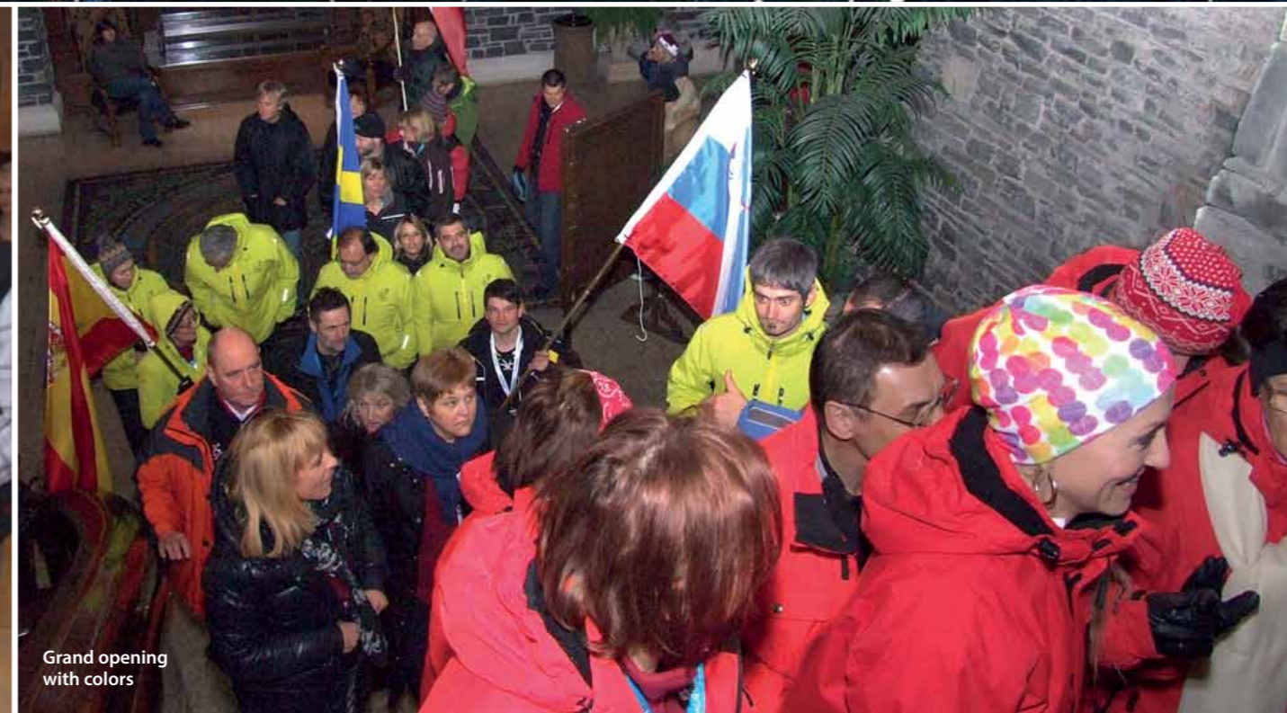
Grand opening with colors