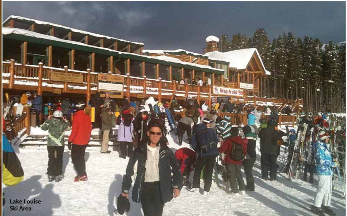
Lake Louise Ski Area

Black tie for the gala dinner! Easy for the ladies. Their evening dresses could be rolled up in a ski boot. Men have to leave something more important off of their luggage. However Bow Valley Tuxedos Ltd. in Canmore would sell or rent us the sufficient outfits. So, on our way from Calgary we Finns stopped in Canmore and bought whole sets of tux, shirt, shoes, bow tie and suspenders, brand new, for 120 $. Unfortunately the ones George Clooney and Brad Pitt had once rented had been sold. Anyway, it was probably just a legend.