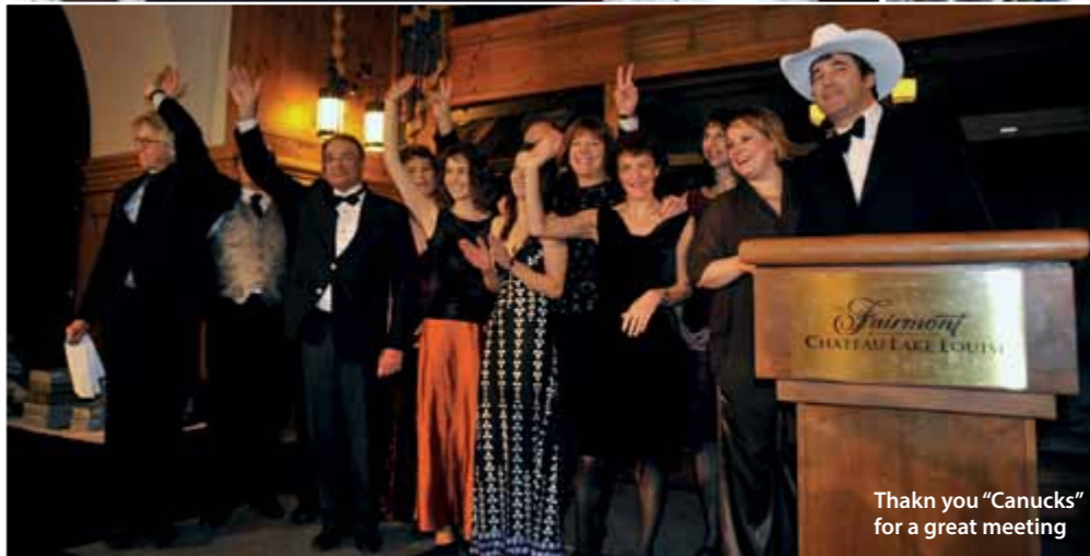
Thank you "Canucks" for a great meeting