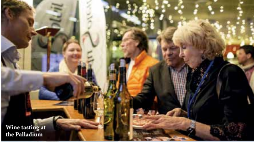
Wine tasting at the Palladium