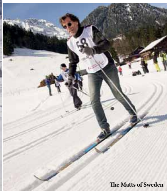
The Matts of Sweden