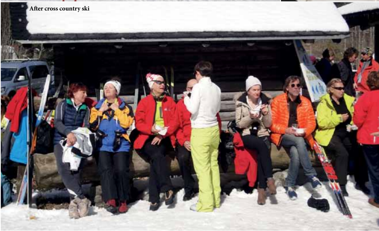
After cross country ski