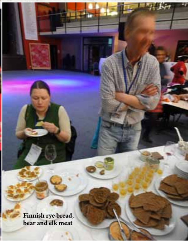
Finnish rye bread, bear and elk meat