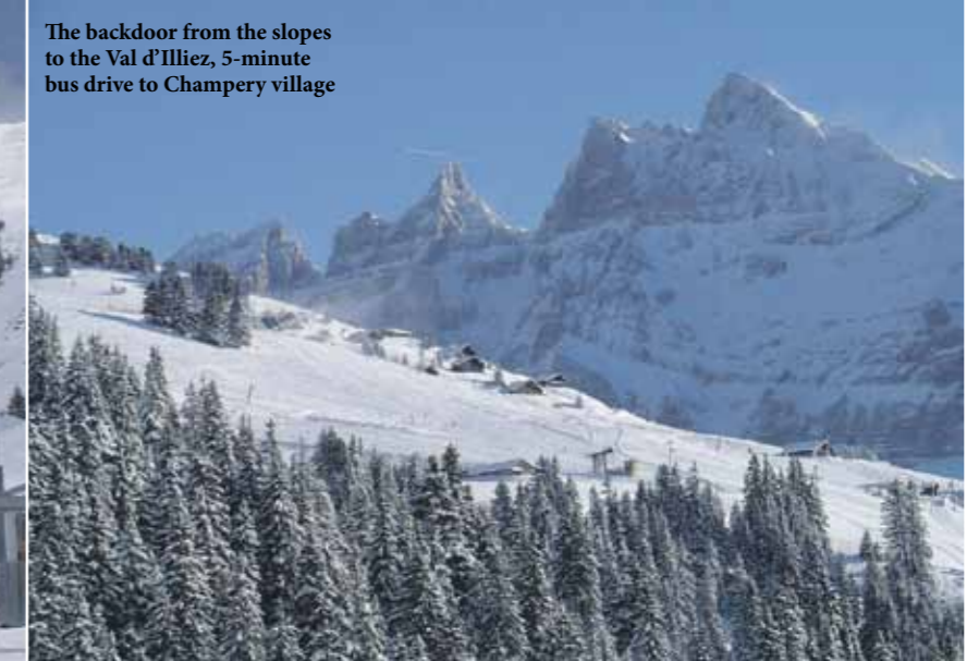
The backdoor from the slopes to the Val d'Illiciez, 5-minute bus drive to Champery village