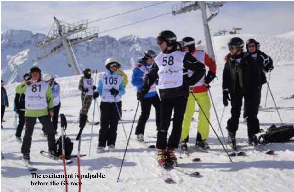
The excitement is palpable before the GS race