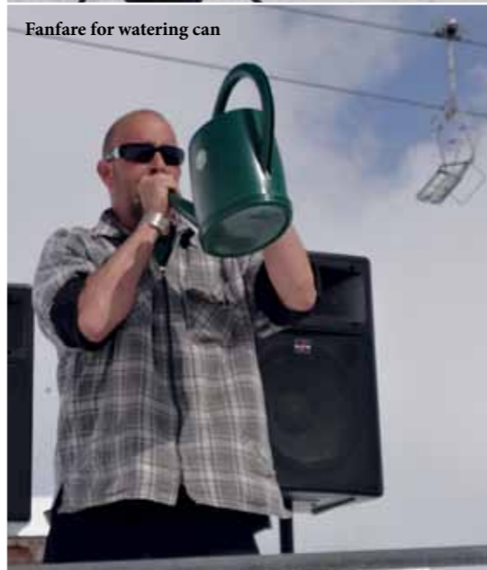
Fanfare for watering can