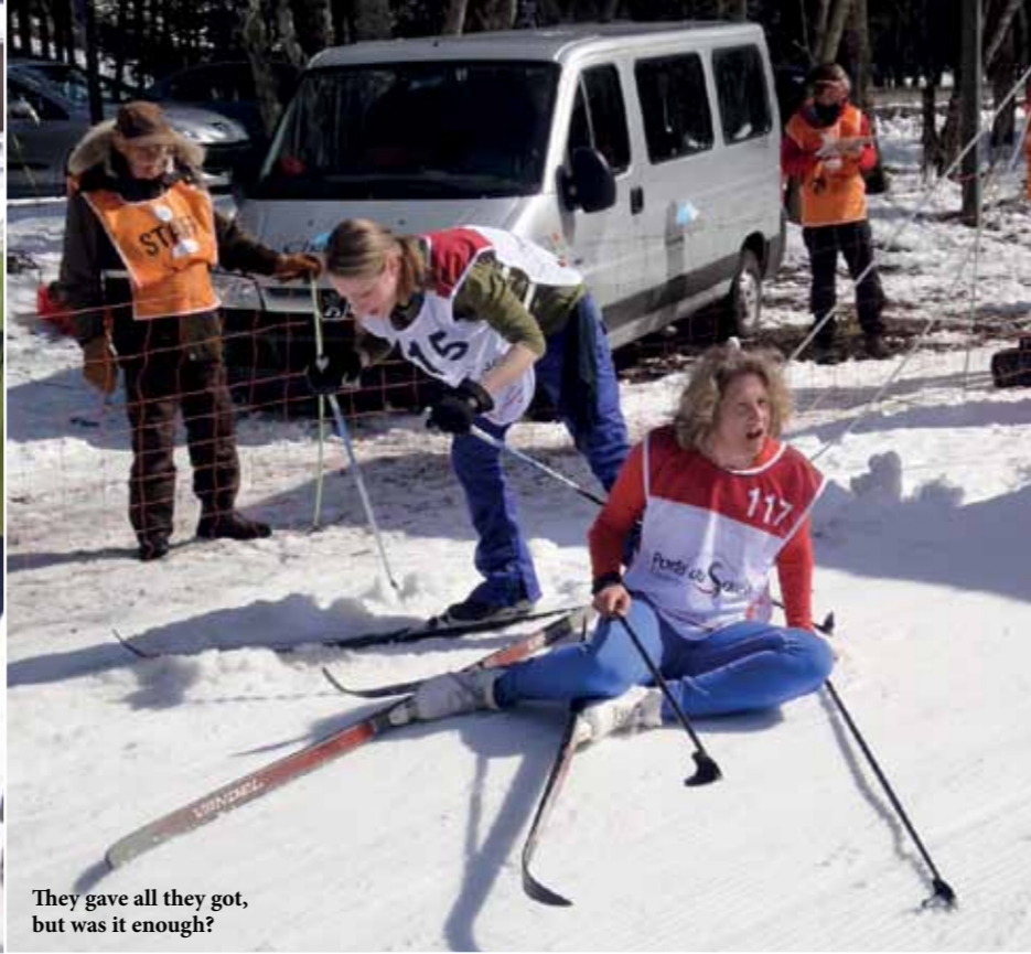
They gave all they got, but was it enough?