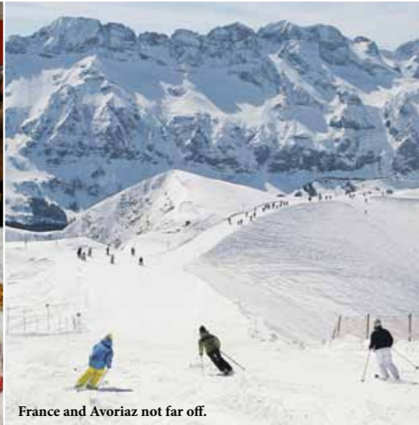
France and Avoriaz not far off.