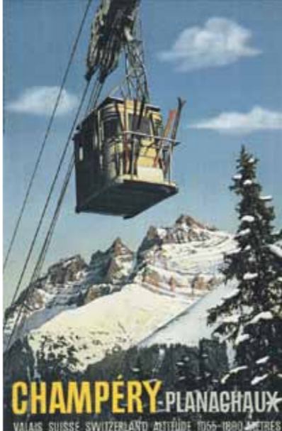
CHAMPÉRY-PLANACHAUX VAIS SUISSE SWITZERLAND ALTITUDE 1065-1890 METRES