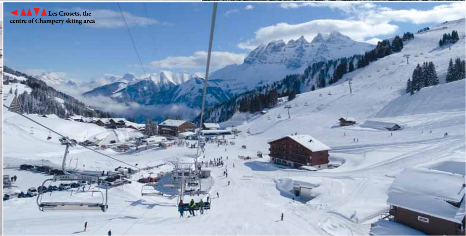
Les Crosets, the centre of Champery skiing area